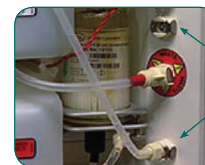
sheath filter bypassed